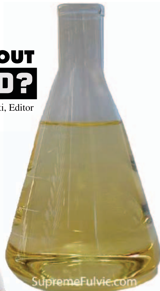
Fulvic Acid Solution

"The Chinese understood humic acid and fulvic acid for centuries. They wrote out lists of every type of disease that was benefited by them. It's possible that the Chinese herbal recipes utilized the humic ore veins throughout China, perhaps planting or cultivating their herbs from these regions," Dean said. "What